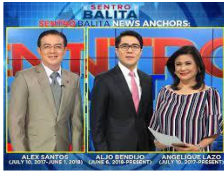
PTV's Sentro Balita hosts.