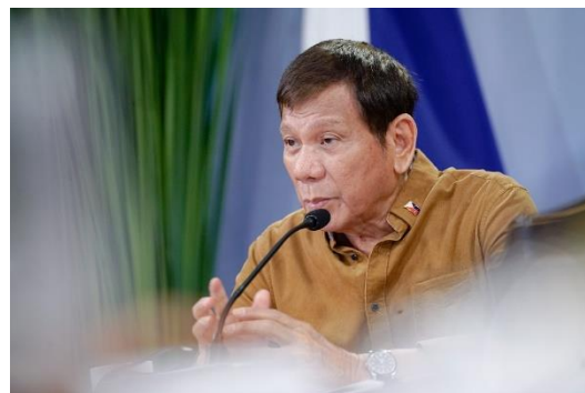
Photo capture of PRRD Talks to the Nation