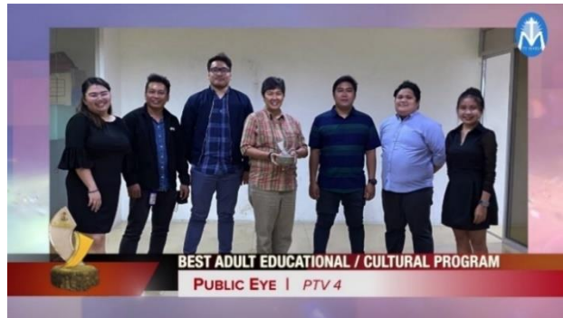
PTV Program winners of Gandingan 2020 and 42 nd Catholic Mass Media Awards 2020 for DILG Tayo Na! and Public Eye).