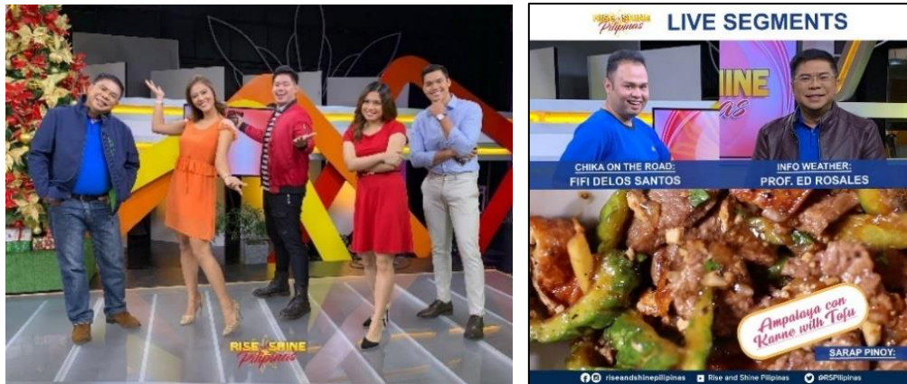
Hosts of PTV's Rise and Shine Pilipinas.