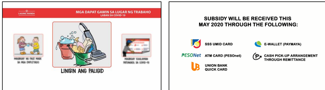
Photo captures of COVID-19 plugs (Workplace Must-Do’s and RA 11469 Bayanihan Act)