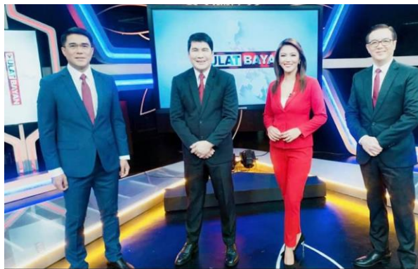
The Hosts of PTV's Ulat Bayan.