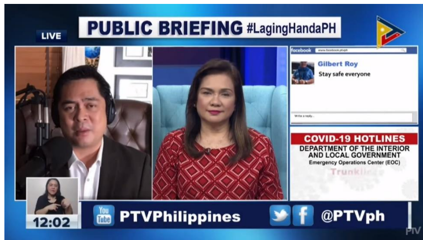
Photo capture of Sec. Andanar and USec. Ignacio for Public Briefing