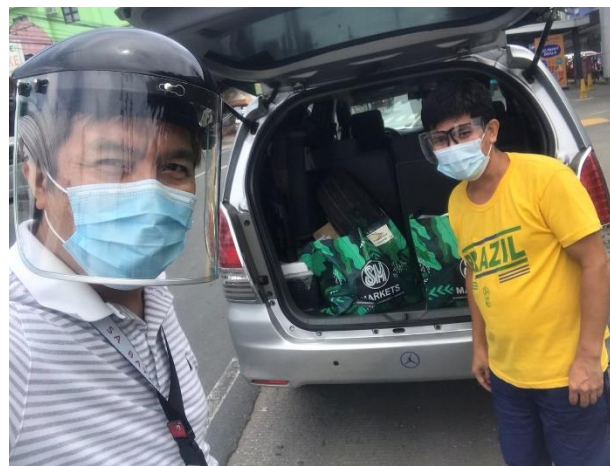
Distribution of care/health packs by PTV to its employees.