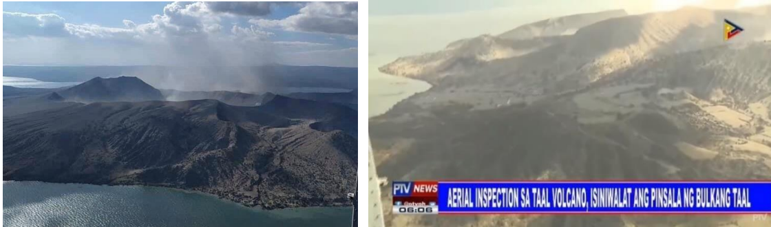
(L) File-photo of Taal Volcano and (R) an aerial view after its eruption in January 2020.

Year 2020 literally started with a bang with the unexpected eruption of one of the smallest yet most active volcanoes in the world – Taal. Government quickly responded by providing assistance to communities that have been directly and indirectly affected by the catastrophe; and PTV was there every step of the way through the delivery of timely news on the disaster and recovery efforts to the public.