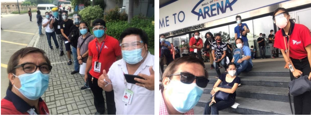
PTV employees for COVID-19 testing in 2020.