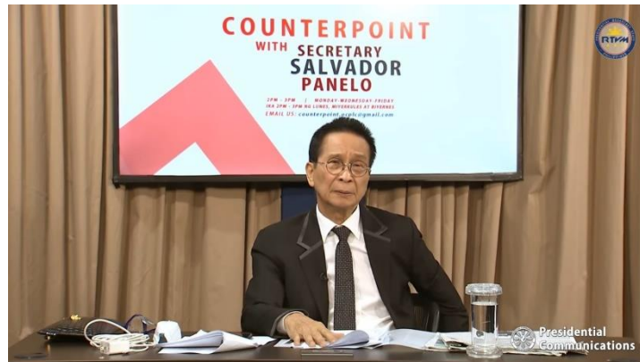
Photo capture of Counterpoint with Sec. Salvador Panelo