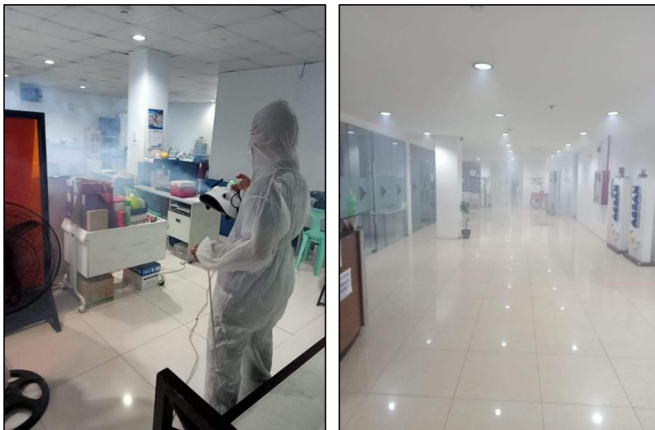
Disinfection of PTV's premises in Quezon City.