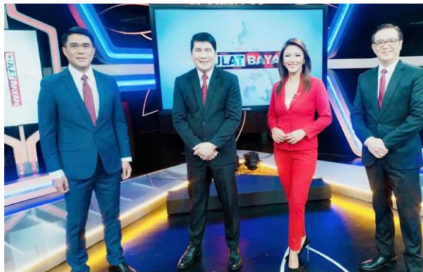
The Hosts of PTV's Ulat Bayan.