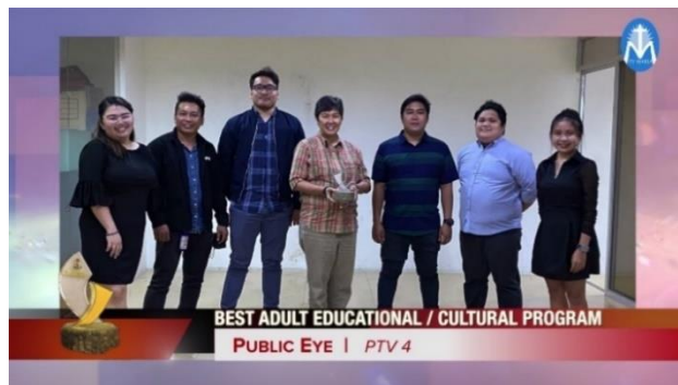
PTV Program winners of Gandingan 2020 and 42 nd Catholic Mass Media Awards 2020 for DILG Tayo Na! and Public Eye).