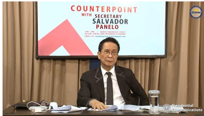
Photo capture of Counterpoint with Sec. Salvador Panelo