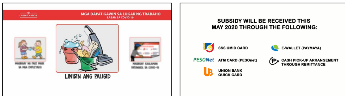
Photo captures of COVID-19 plugs (Workplace Must-Do's and RA 11469 Bayanihan Act)