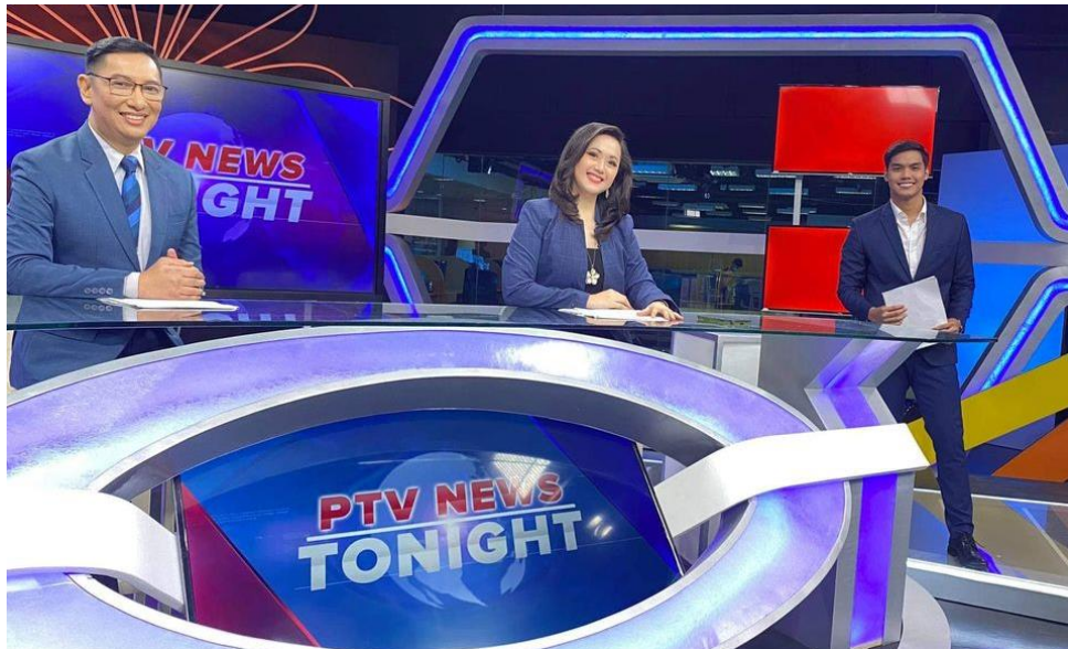
The PTV News Tonight on the new set in 2020.