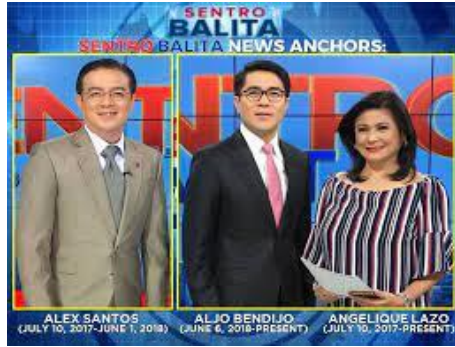
PTV's Sentro Balita hosts.