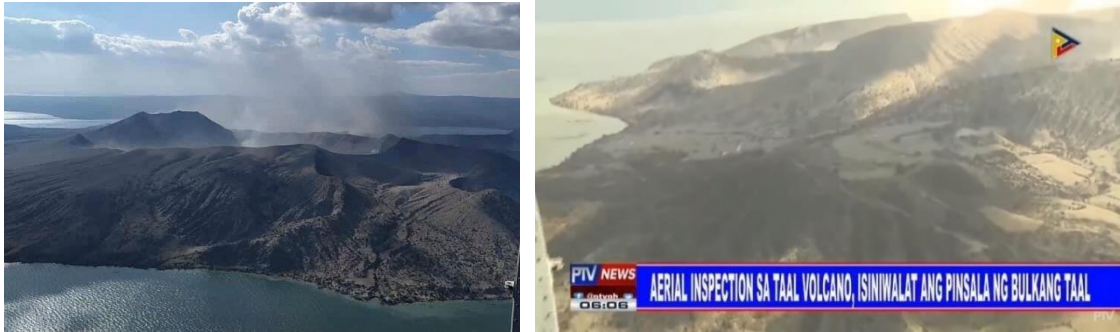
(L) File-photo of Taal Volcano and (R) an aerial view after its eruption in January 2020.

Year 2020 literally started with a bang with the unexpected eruption of one of the smallest yet most active volcanoes in the world – Taal. Government quickly responded by providing assistance to communities that have been directly and indirectly affected by the catastrophe; and PTV was there every step of the way through the delivery of timely news on the disaster and recovery efforts to the public.