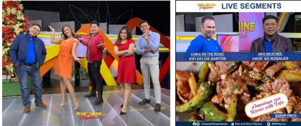
Hosts of PTV's Rise and Shine Pilipinas.